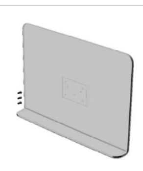
TR-L-1 Tray (16"x12") w/ a lip on one edge MSRP: $149