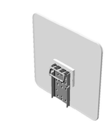
TR-12/12 w/QRP Tray (12"x12") (QRP attached) MSRP: $199