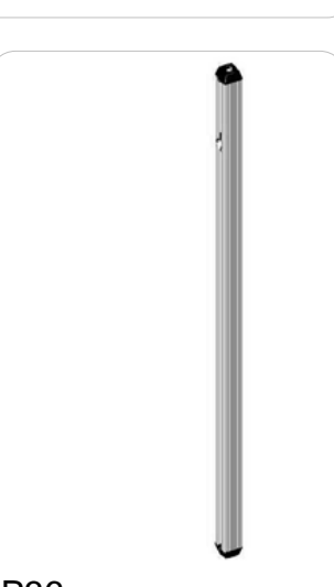
P36 Post – length (inches) MSRP: $69