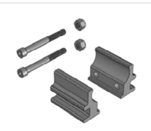
WC-R7/8 Wheelchair Clamp, 7/8" Round MSRP: $32