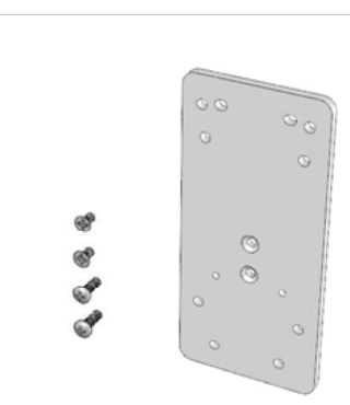
DP-DV1 Device Plate – Dynavox MSRP: $30 Attaches to Dynavox Vmax, Eyemax, DV4, MT4