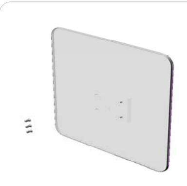
TR-12/12 Tray (12"x12") MSRP: $124

Note: One QRP included w/ each M0, M1, M2 mounts