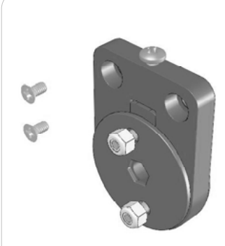
DRA Device Rotator Adapter

MSRP: $59 Adjusts angle of a device on the QRP