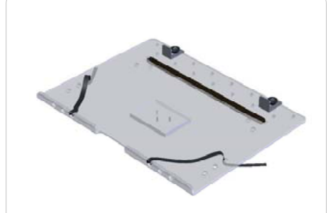
TR-LT Laptop tray MSRP: $249