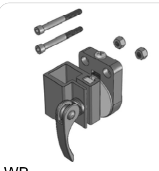
WB Wheelchair Bracket MSRP: $111