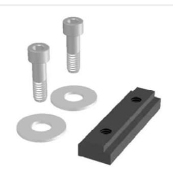
TN T-Nut MSRP: $32