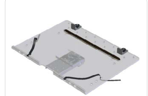
TR-LT w/QRP Laptop tray (QRP attached) MSRP: $324