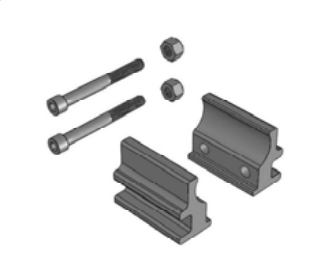
WC-R1 Wheelchair Clamp, 1" Round MSRP: $32